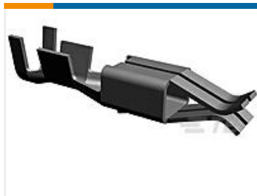
TE Part # 925595-1 MIN.SPRING RECEPT.