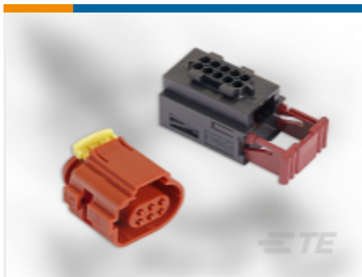
TE Part # CAT-T4827-CH8172 TIMER, CONNECTOR HOUSING